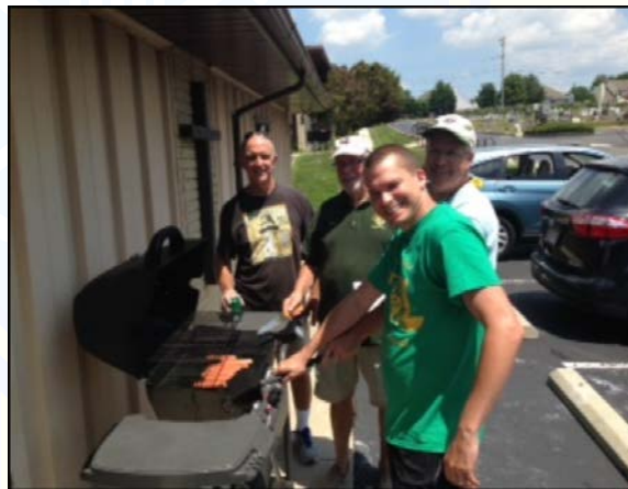
Fishing Tournament Saturday July 23, 2016