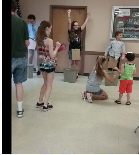
Parish Picnic Sunday August 21 st , 2016